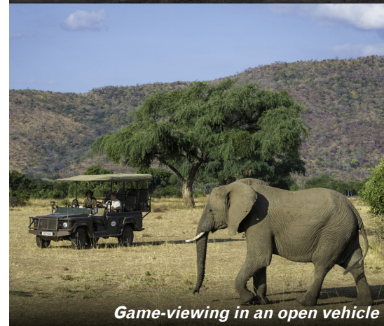
Game-viewing in an open vehicle