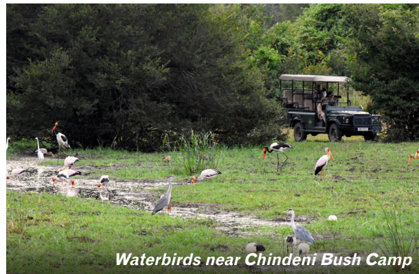
Waterbirds near Chindeni Bush Camp