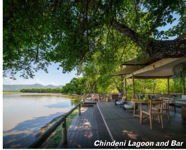
Chindeni Lagoon and Bar