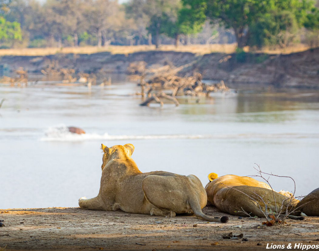
Lions & Hippos