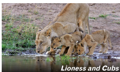
Lioness and Cubs

Ease into Luangwa life with a stay at the award-winning Mfuwe Lodge. Set inside the park, just a five-minute drive from the main gate, the lodge's allure is instantly obvious. Beneath a canopy of ebony and mahogany, its 18 air-conditioned chalets are arranged around the banks of two lagoons where an endless stream of wildlife keeps guests enthralled while lounging on the open deck or taking a dip in the swimming pool. The airy interior of the lodge is an exquisite complement to its natural surroundings.