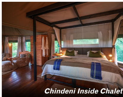
Chindeni Inside Chalet

Three nights at Chindeni Bush Camp in a Tented Chalet (with four-poster bed), inclusive of all meals, local drinks, laundry and scheduled game drives and walks.