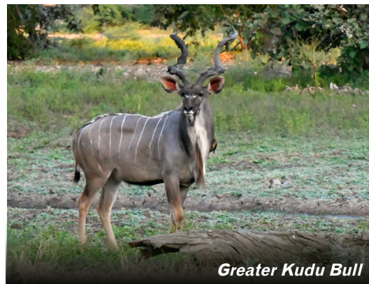
Greater Kudu Bull