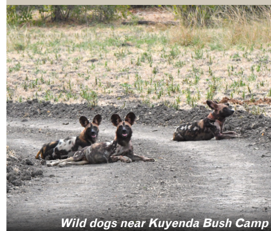
Wild dogs near Kuyenda Bush Camp