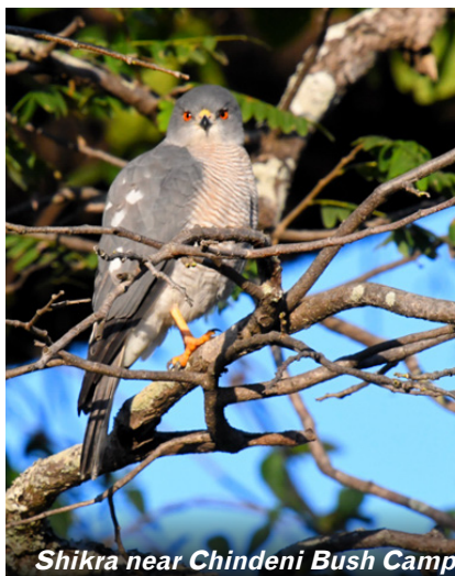
Shikra near Chinden Bush Camp

Situated in the shady grounds of Mfuwe Lodge, the Phil Berry Centre comprises a library and photographic studio. Mfuwe Lodge also offers the chance to relax at its Bush-Spa or to buy a few Zambia mementos at their curio shop.