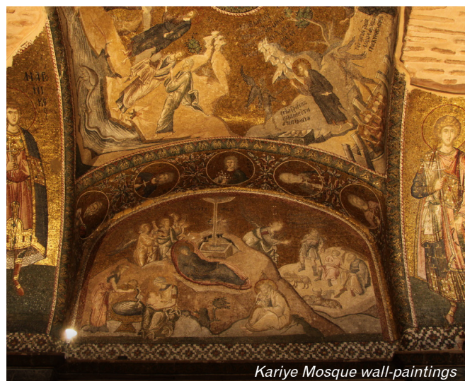
Kariye Mosque wall-paintings