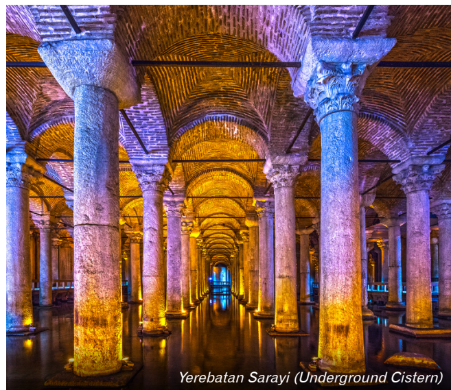
Yerebatan Sarayı (Underground Cistern)

Lunch at a local restaurant. Return by coach to the Sultanahmet area to visit the Hagia Sophia, one of the great architectural wonders of the world. Built by the Emperor Justinian in the mid-5th century AD, this vast building with its huge dome still dominates the city. After the Turks conquered Constantinople (and renamed it Istanbul) in 1453 it became a mosque and remained so until Kemal Ataturk turned it into a museum in 1933 and restored its superb mosaics. In 2020 it reverted to a mosque. Return to the hotel. Dinner under own arrangements.